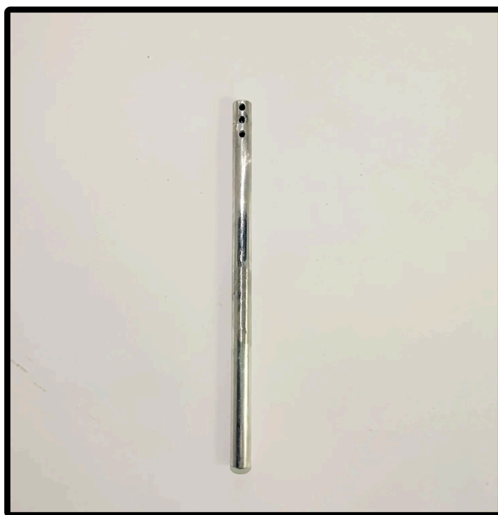
Fig.1 Mithril Plunger