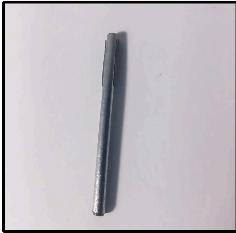
Fig.3 Mithril Plunger Pin

One of the most commonly utilized consumables, the plunger pin seamlessly integrates with TEXSTEAM pump model 4300.